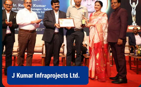
J Kumar Infraprojects Ltd.