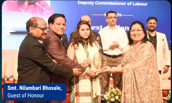
Smt. Nilambari Bhosale, Deputy Commissioner of Labour Guest of Honour