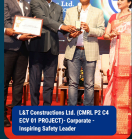
L&T Constructions Ltd. (CMRL P2 C4 ECV 01 PROJECT) - Corporate - Inspiring Safety Leader