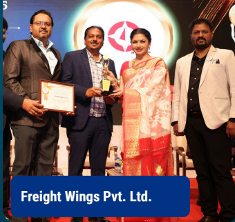
Freight Wings Pvt. Ltd.