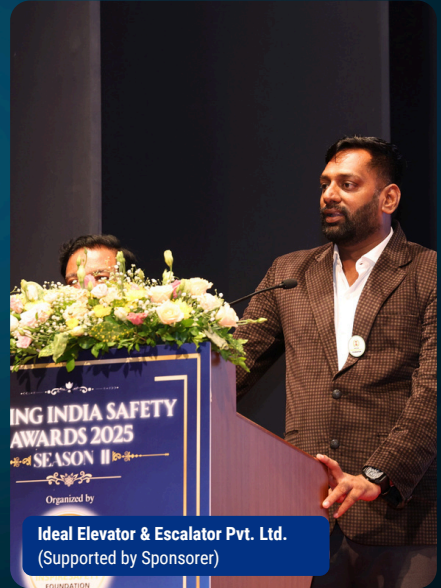
Ideal Elevator & Escalator Pvt. Ltd. (Supported by Sponsor)