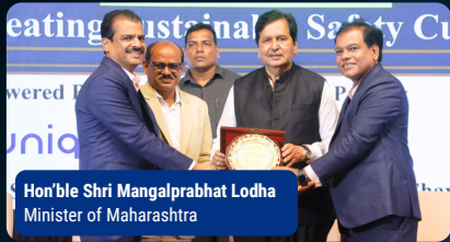
Hon'ble Shri Mangalprabhat Lodha Minister of Maharashtra