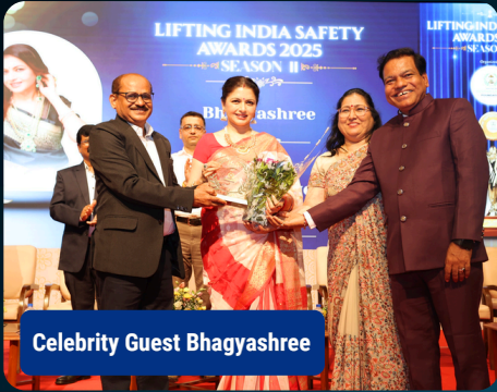
Celebrity Guest Bhagyashree